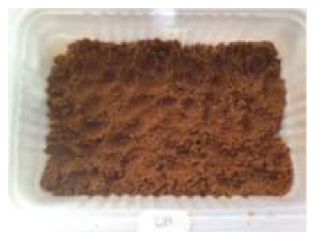
Figure 2.4 Coco Peat