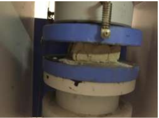
Fig 3.1Compression testing on mycelium brick

After hardening of the brick, the compressive strength test on hardened mycelium bricks were performed on the compressive testing machine as shown in figure 3.1. Two bricks were tested of different sizes.