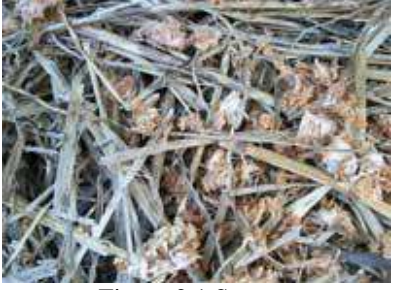
Figure 2.1 Straws

Grain straw such as wheat, rye, and oat all make a good substrate. They are easy to get andcheap. As they contain microbes that can interfere in the growth of mycelium, so they must beprepared first.