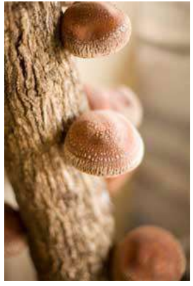
Figure 2.2 logs

As mentioned earlier mycelium can be grown on anything. Wooden logs are also a great substrate for mycelium. However, often any quickly decomposing hardwood that's not too dense will do. Elm, beech, alder, ash, and cottonwood are all good choices. Thicker hardwoods, such as oak,will take much longer to produce mushrooms. But wooden logs take too much time to colonize mycelium.