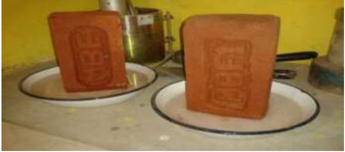
Figure 3.2 Efflorescence test on bricks

As efflorescence alone is not a problem but it is the reason of many problems like water intrusion, Structural damage and health problems etc, Efflorescence can be removed by dry brushing and washing repeatedly. To check which brick has less efflorescence mycelium brick or Standard brick we have tested both the bricks for the efflorescence test.